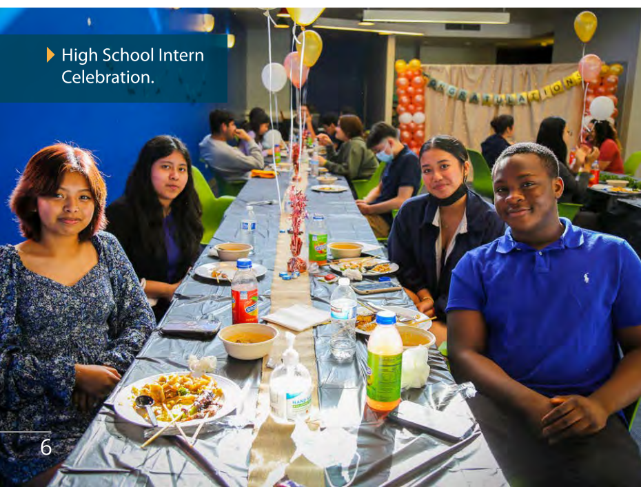
▶ High School Intern Celebration.