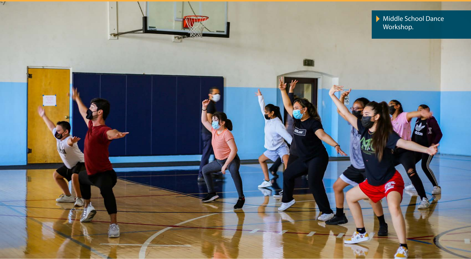
▶ Middle School Dance Workshop.