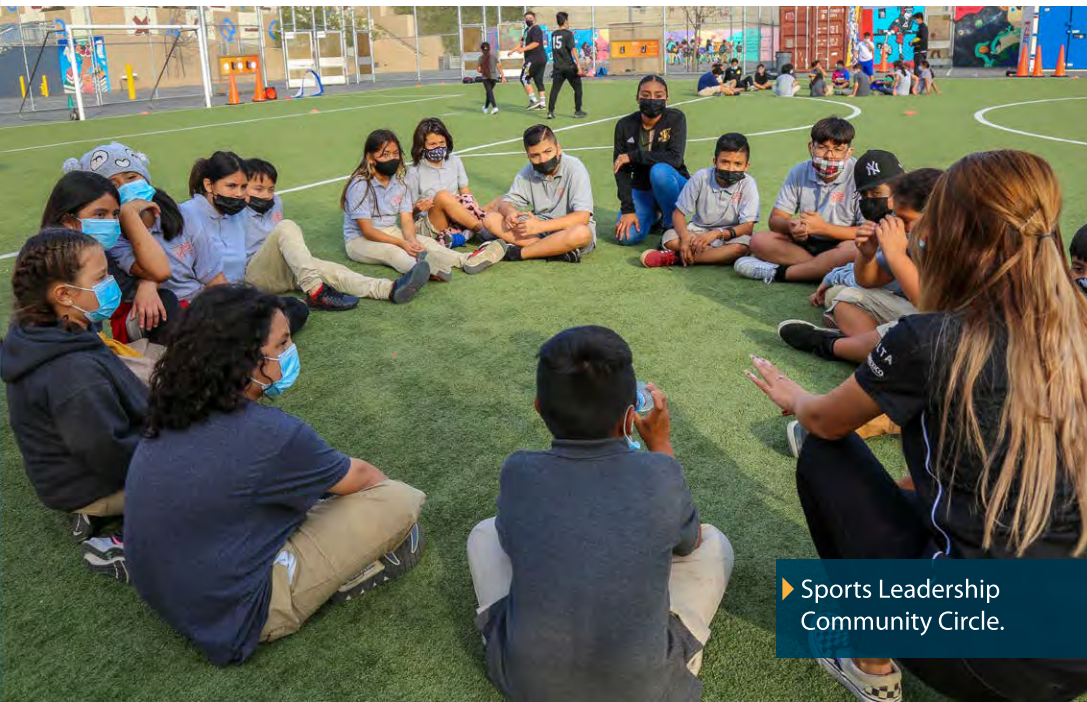
► Sports Leadership Community Circle.