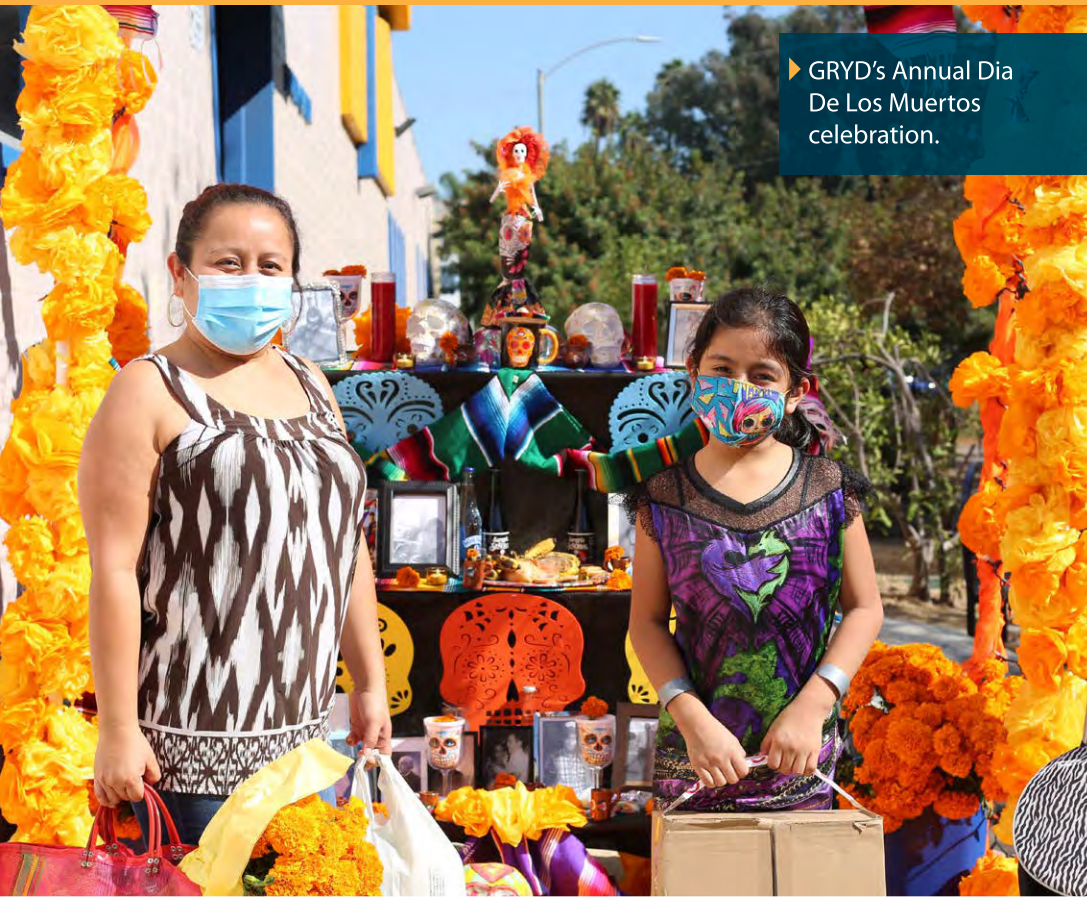
► GRYD's Annual Dia De Los Muertos celebration.